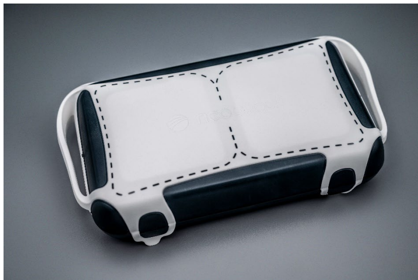
Figure 1 – „The Precious“ ready to use after molding (ref: Rico)

One particular example of this can be found at the Arburg booth in hall A3, where the versatile dustproof and splash-resistant multifunctional box 'The Precious' is showcased. It was developed and brought to life by the elastomer expert RICO. The large two-component part made of PBT and self-bonding LSR was realized with help of SIGMASOFT ® .